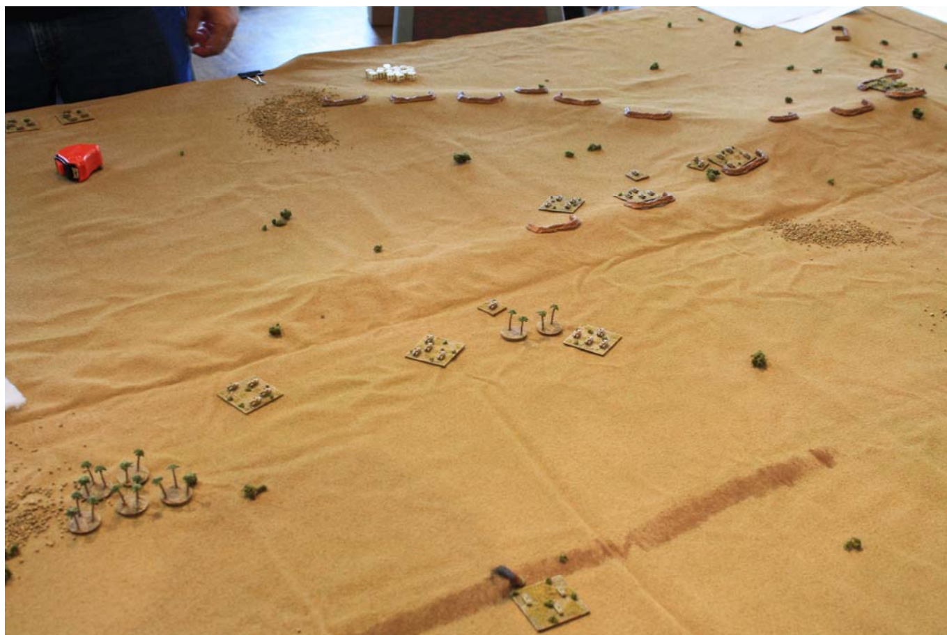
The Reserve Battalion of Sh'ot MBT moves to reinforce the threatened flank:

The Israeli reserve Tank Battalion took longer than hoped to move around to the rear of the threatened flank (the tail-end of the reserve column can be seen at the top left of the picture below). The forward company of Sh'ot from 77 th Tank Battalion took the drastic action of moving forward out of their entrenchments to close the range with the Syrian T-55s. They ended up being relatively safe due to the Syrian tanks' restricted vision , and as a result they started causing flank-shot casualties on the Syrian T-55s from long range. The other Company of this battalion moved forward into the positions vacated by the first company, ensuring the front was covered in the case of any secondary Syrian thrust in this sector.