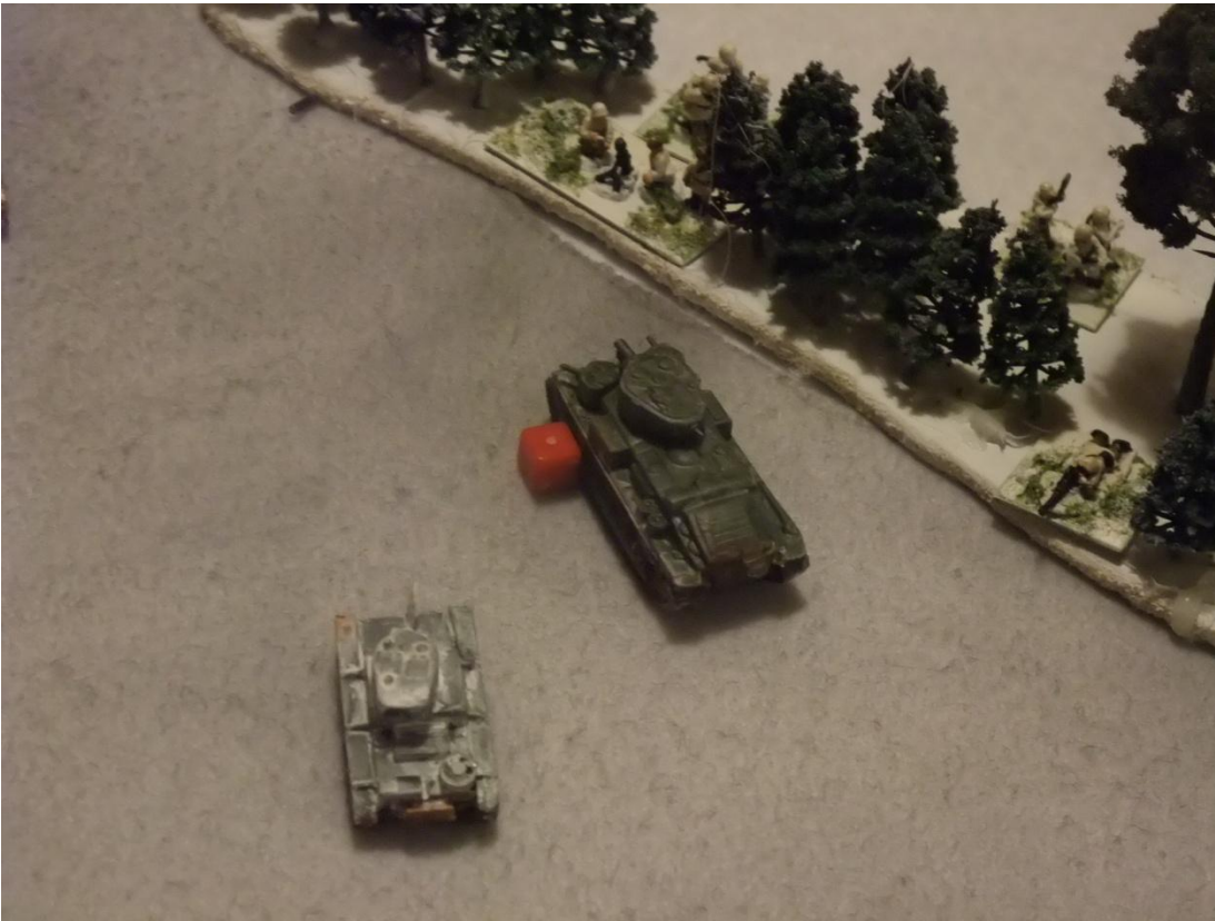
The T28 starts to menace the Finnish Infantry when a loud cracking of the ice is heard