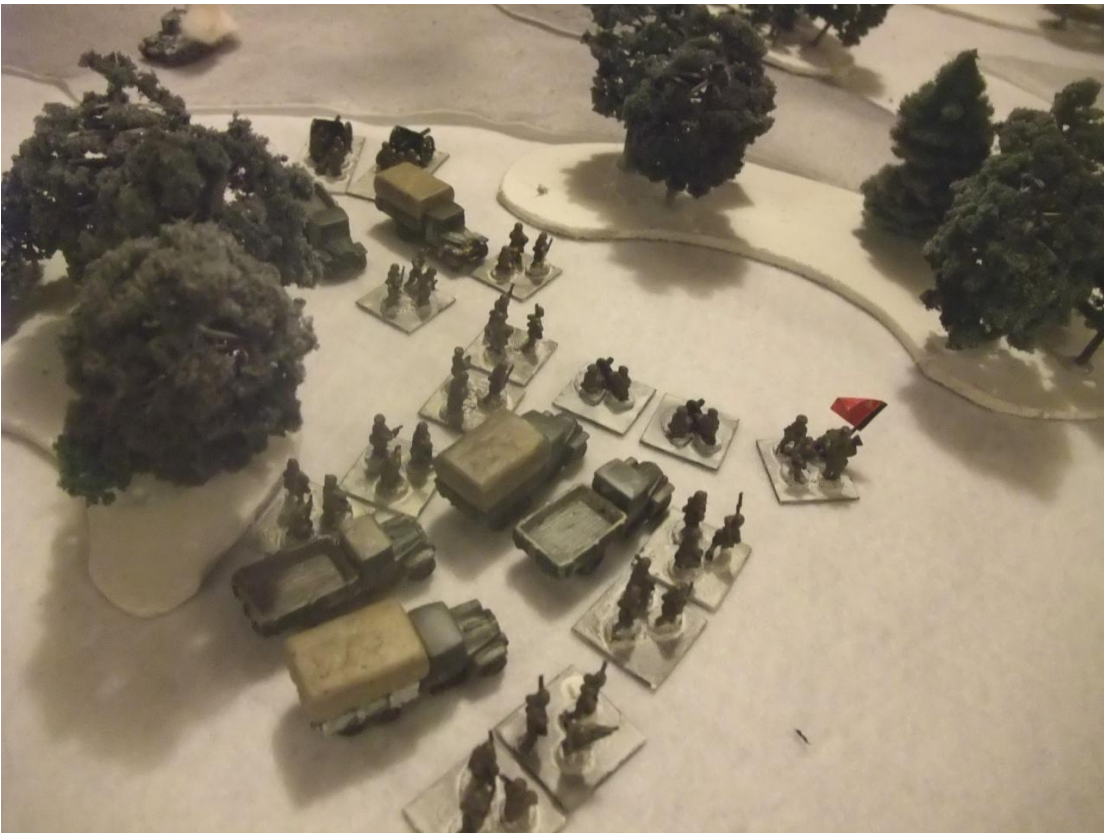
Finally they deploy – but they are destined not to move again!