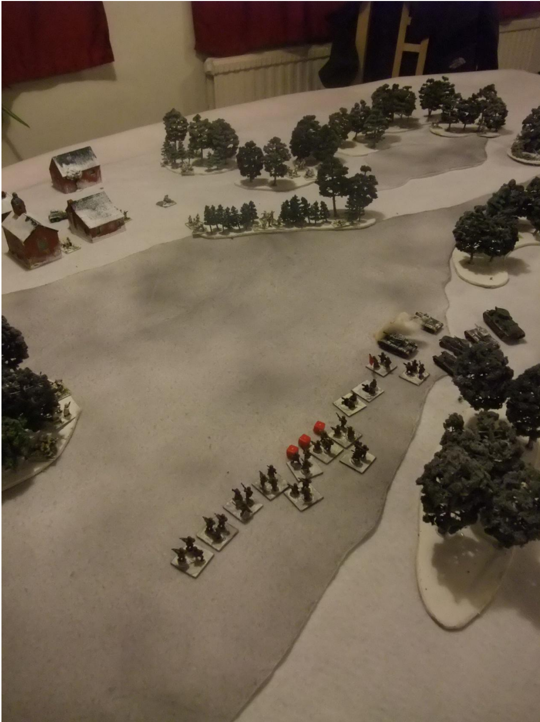
Russian Battlegroup 1 start their advance across the frozen lake, there are small number of Finns on the island on the left , The Finnish ATG and mortar succeed in taking out a T26 early in the advance.