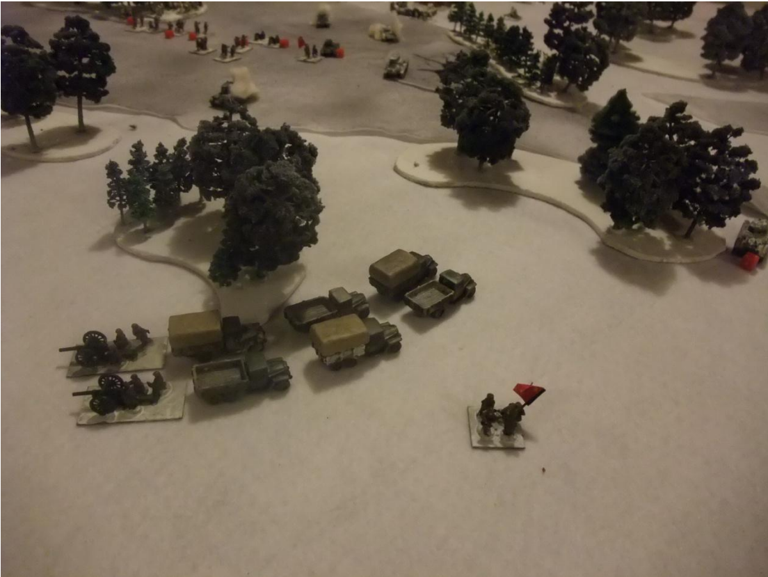
Russian Battlegroup 2 couldn't deploy due to poor dice and the crap CV of the HQ