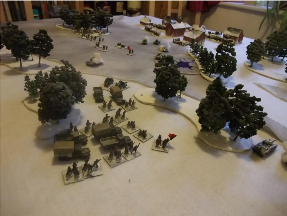
Potentially the Russians can still take the village