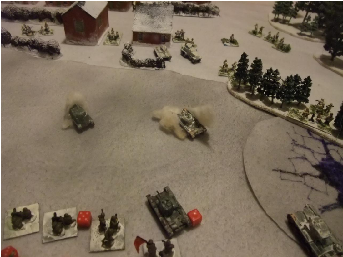
The Leading T26s are taken out by the Finnish ATG between the houses and the Finnish BA10 & T26.