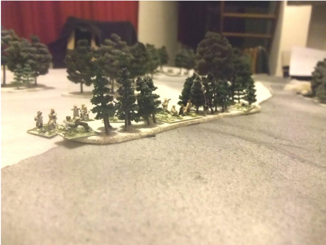
The Finns await the advance.