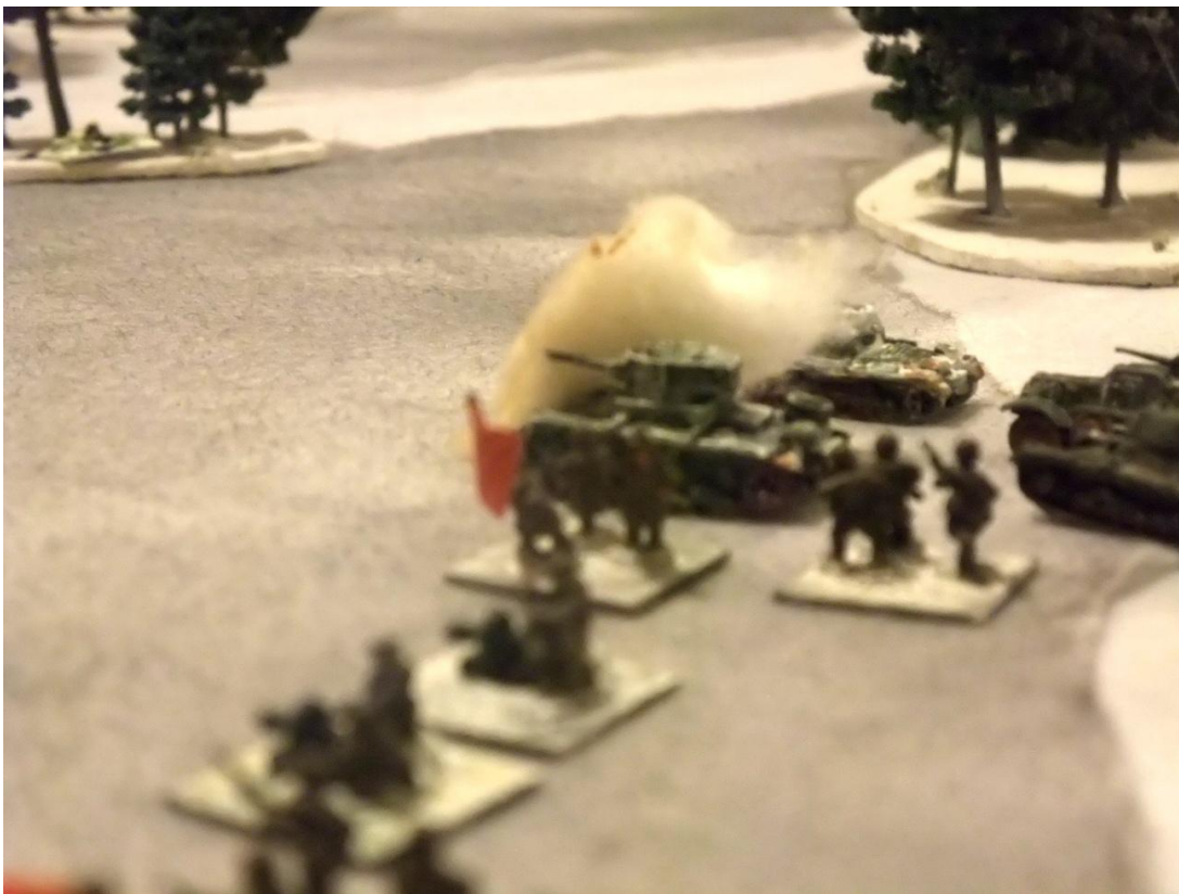
First blood to the Finns