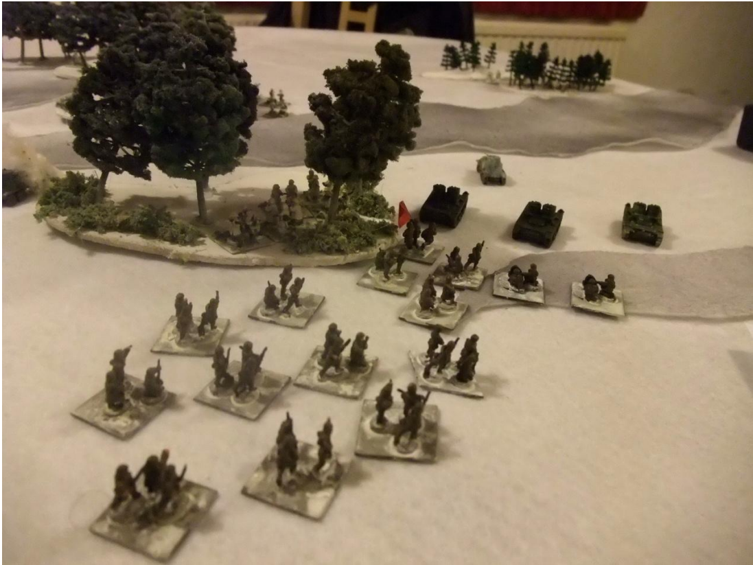
Russian Battlegroup 3 start their flanking move – oblivious of the Finns in the trees.