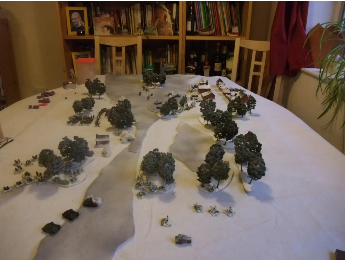
Overall views – The Russians wouldn't get much farther.