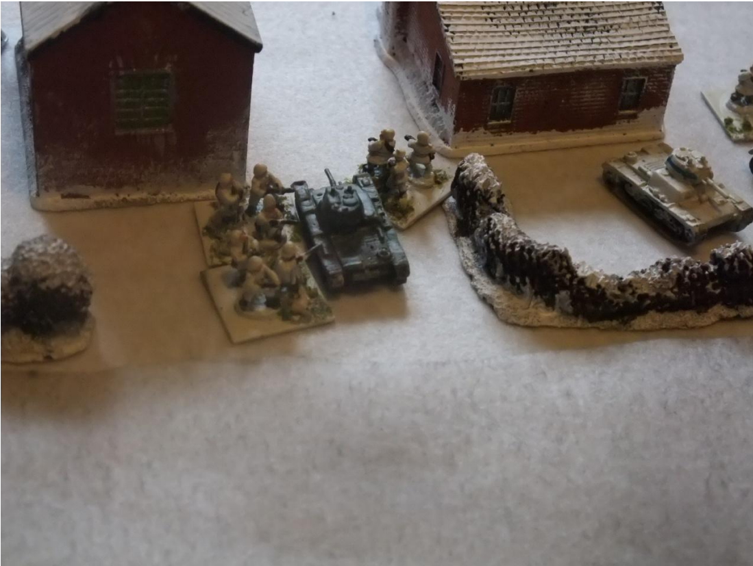
Having disposed of the Finnish ATG the Russians foolishly advanced only to be close assaulted.