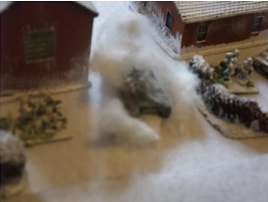
Exploding Tanks always cause Camera Shake!