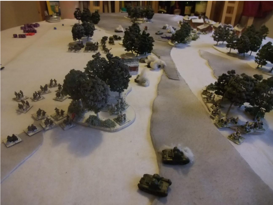
But Russian Battlegroup 3 is also having problems