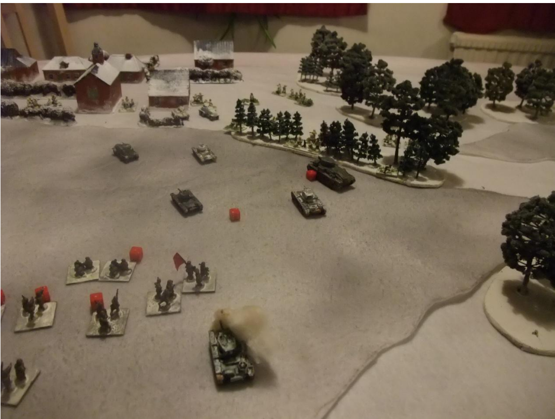
Battlegroup 1 continue their advance across the ice – but things are about to go wrong.