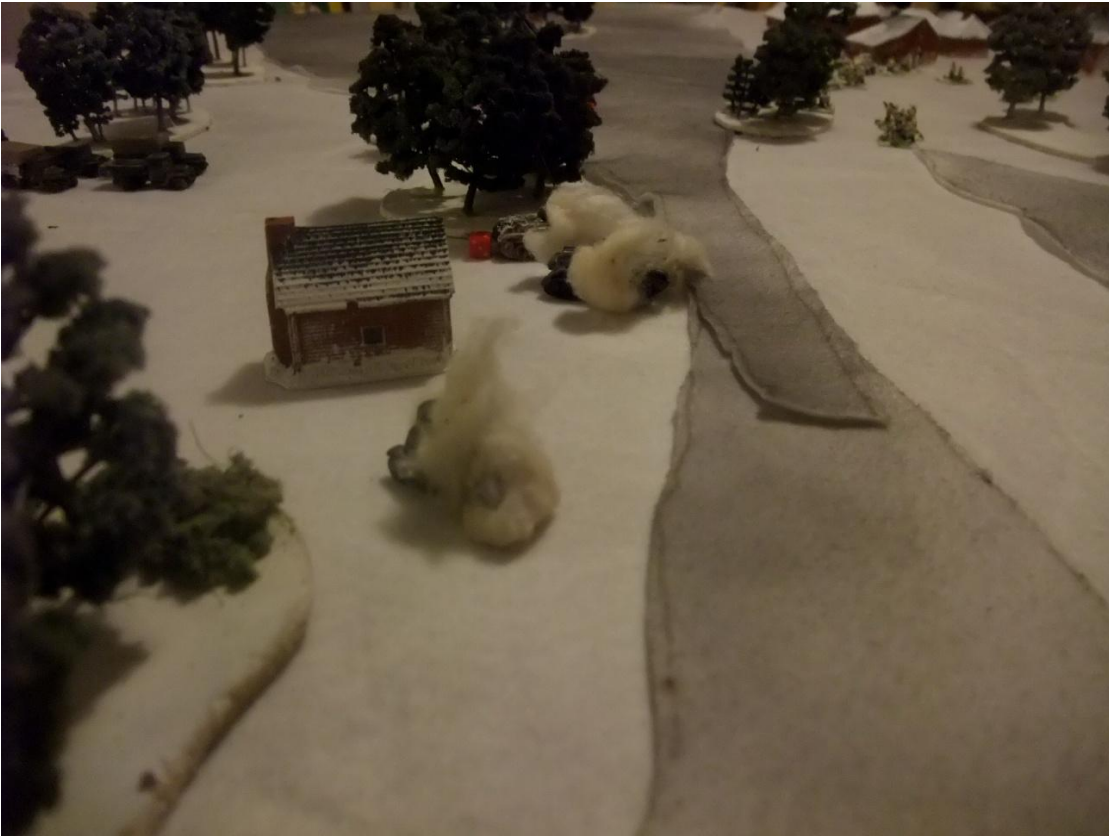
Battlegroup 2 – The column of trucks await in the background whilst the tanks and armour car locate the minefield the hard way!